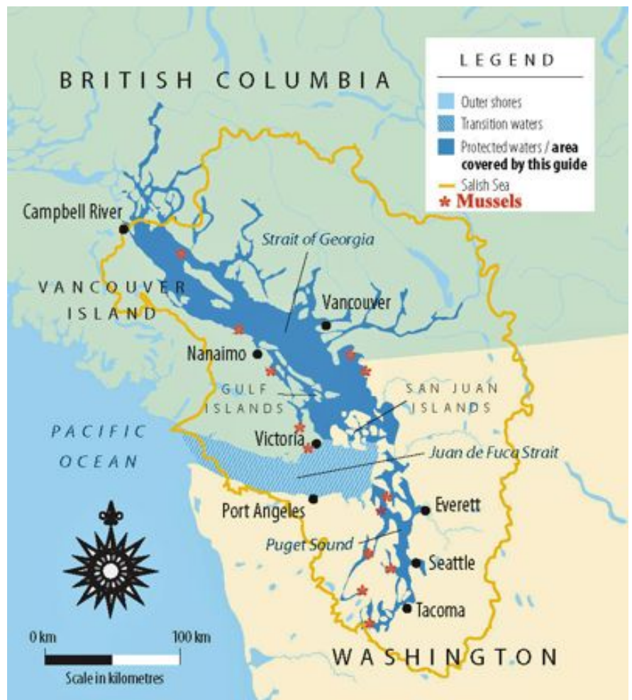
Figure of widespread locations (approximate) of A. senhousia (excluding sites on the west coast of Vancouver I. )