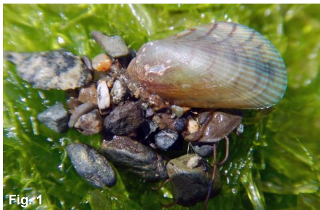
Figure 1. Ladysmith Harbour, single specimens in mud-gravel; gravel bound in the byssal mat; intertidal. May, 2014.