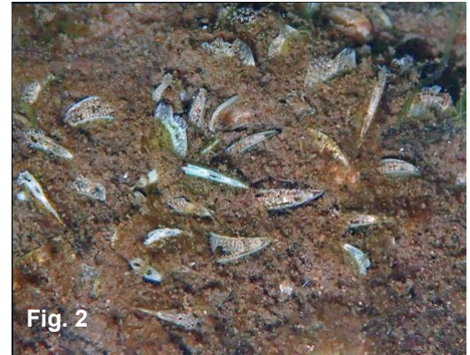
Figure 2. High density mussel mat, A. senhousia . Whidbey Island, WA, tidal pools. Nov. 22, 2020.

There are museum lots of A. senhousia from Hood Canal, Washington at the LACM and RBCM (Table 2). Similar to BC, individual mussels have been detected in Manila clam surveys in Hood Canal (2016, 2017 M. Duthier, pers. comm.; 2020 J. Ruesink, pers. comm.). There are historic records for Oyster Bay and recent discoveries at Whidbey Island (2013-2020) in tidal pools that were found to have high density mats of A. senhousia and individuals attached to algae and wood debris (Jan Kocian, pers. comm.; Figures 2,3,4).